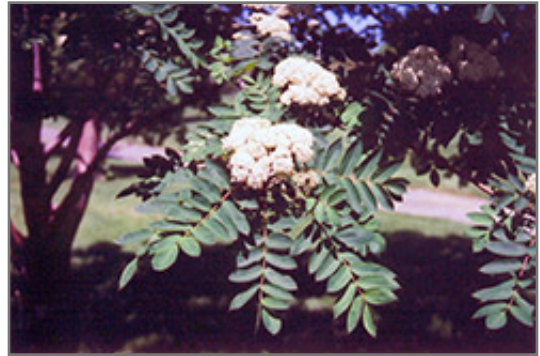
Showy Mountain Ash flowers

This tree should only be grown in full sunlight. It is very adaptable to both dry and moist locations, and should do just fine under average home landscape conditions. It is not particular as to soil type or pH. It is highly tolerant of urban pollution and will even thrive in inner city environments. This species is native to parts of North America.