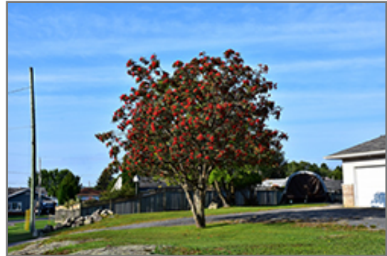
Showy Mountain Ash fruit