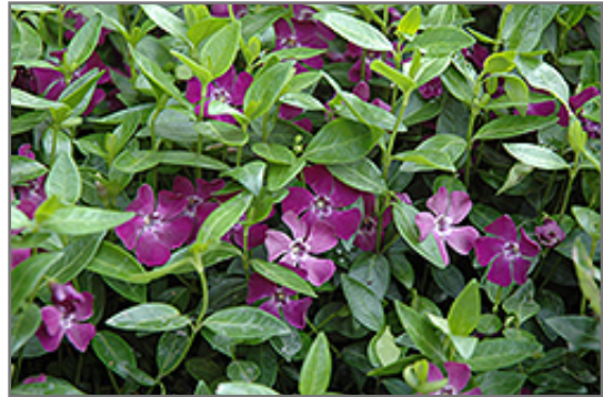
Burgundy Periwinkle flowers