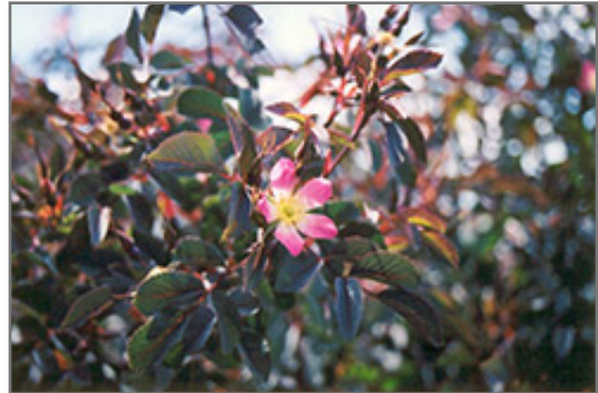
Red Leaf Rose flowers

This is a high maintenance shrub that will require regular care and upkeep, and is best pruned in late winter once the threat of extreme cold has passed. It is a good choice for attracting bees to your yard. Gardeners should be aware of the following characteristic(s) that may warrant special consideration;