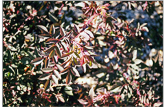
Red Leaf Rose foliage

This shrub should only be grown in full sunlight. It does best in average to evenly moist conditions, but will not tolerate standing water. It is not particular as to soil type or pH. It is highly tolerant of urban pollution and will even thrive in inner city environments. This species is not originally from North America.