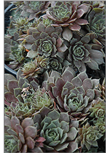
Silverine Hens And Chicks foliage

Silverine Hens And Chicks is recommended for the following landscape applications;