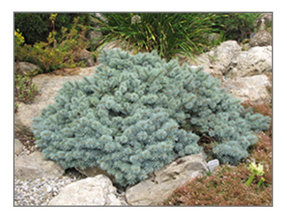
St. Mary's Broom Creeping Blue Spruce

St. Mary's Broom Creeping Blue Spruce is recommended for the following landscape applications;