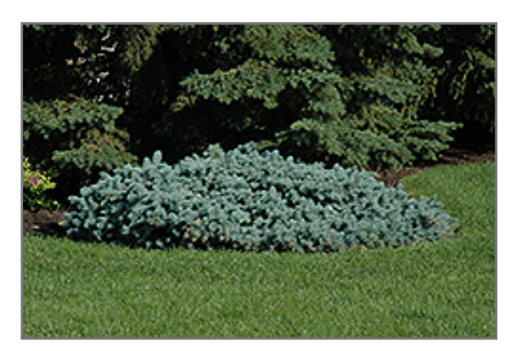
St. Mary's Broom Creeping Blue Spruce