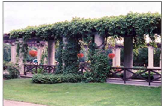
Virginia Creeper