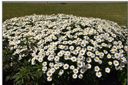
Becky Shasta Daisy in bloom