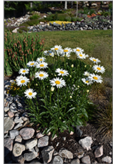
Becky Shasta Daisy in bloom

Becky Shasta Daisy is a fine choice for the garden, but it is also a good selection for planting in outdoor pots and containers. Because of its height, it is often used as a 'thriller' in the 'spiller-thriller-filler' container combination; plant it near the center of the pot, surrounded by smaller plants and those that spill over the edges. It is even sizeable enough that it can be grown alone in a suitable container. Note that when growing plants in outdoor containers and baskets, they may require more frequent waterings than they would in the yard or garden. Be aware that in our climate, most plants cannot be expected to survive the winter if left in containers outdoors, and this plant is no exception. Contact our experts for more information on how to protect it over the winter months.