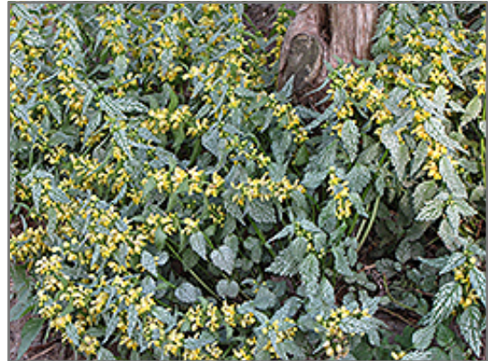
Hermann's Pride Yellow Archangel in bloom

This plant does best in partial shade to shade. It is an amazingly adaptable plant, tolerating both dry conditions and even some standing water. It is considered to be drought-tolerant, and thus makes an ideal choice for a low-water garden or xeriscape application. It is not particular as to soil type or pH. It is highly tolerant of urban pollution and will even thrive in inner city environments. This is a selected variety of a species not originally from North America. It can be propagated by division; however, as a cultivated variety, be aware that it may be subject to certain restrictions or prohibitions on propagation.