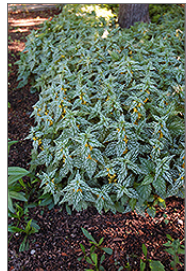
Hermann's Pride Yellow Archangel in bloom