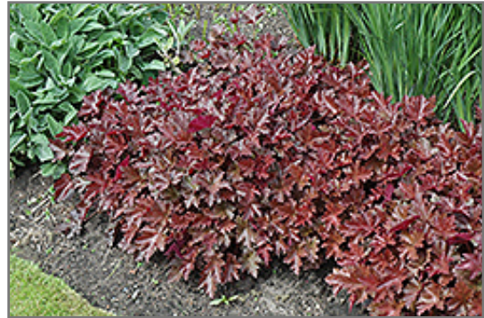
Chocolate Ruffles Coral Bells

This is a relatively low maintenance plant, and should be cut back in late fall in preparation for winter. It is a good choice for attracting hummingbirds to your yard. It has no significant negative characteristics.