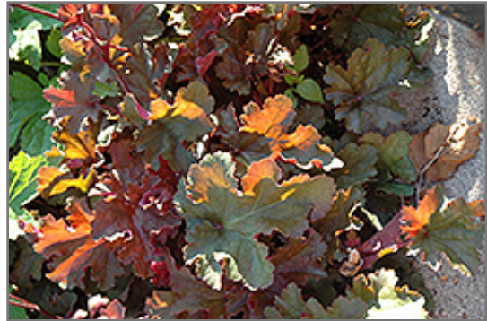
Chocolate Ruffles Coral Bells foliage

Chocolate Ruffles Coral Bells is a fine choice for the garden, but it is also a good selection for planting in outdoor pots and containers. With its upright habit of growth, it is best suited for use as a 'thriller' in the 'spiller-thriller-filler' container combination; plant it near the center of the pot, surrounded by smaller plants and those that spill over the edges. Note that when growing plants in outdoor containers and baskets, they may require more frequent waterings than they would in the yard or garden. Be aware that in our climate, most plants cannot be expected to survive the winter if left in containers outdoors, and this plant is no exception. Contact our experts for more information on how to protect it over the winter months.