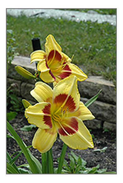
King George Daylily flowers