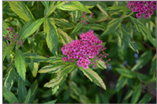
Double Play Painted Lady Spirea flowers

Double Play Painted Lady Spirea is recommended for the following landscape applications;