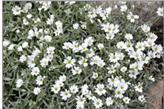
Snow-In-Summer flowers