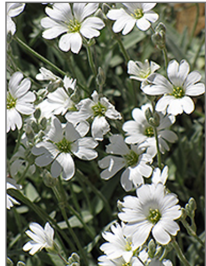
Snow-In-Summer flowers