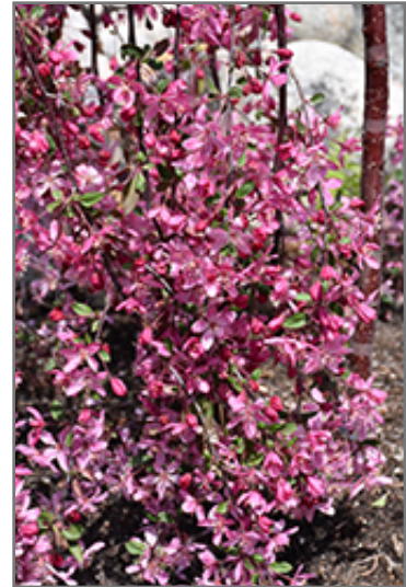
Royal Beauty Weeping Flowering Crab Apple flowers

Royal Beauty Weeping Flowering Crab Apple is recommended for the following landscape applications;