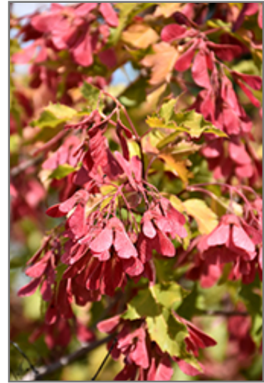
Amur Maple (tree form) fruit

This tree does best in full sun to partial shade. It is very adaptable to both dry and moist locations, and should do just fine under average home landscape conditions. It is not particular as to soil type or pH. It is highly tolerant of urban pollution and will even thrive in inner city environments. This is a selected variety of a species not originally from North America.