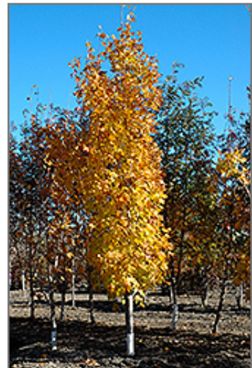
Lord Selkirk Sugar Maple in fall