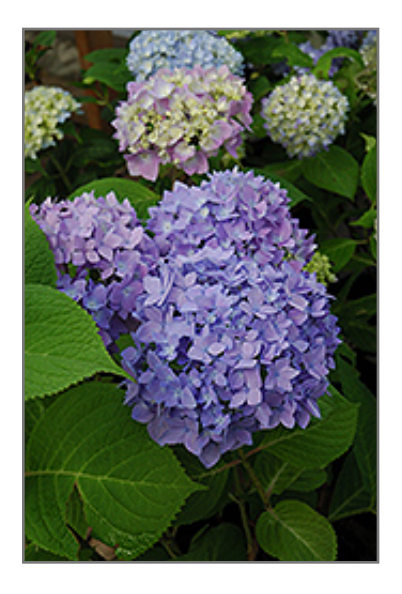
Endless Summer Hydrangea flowers