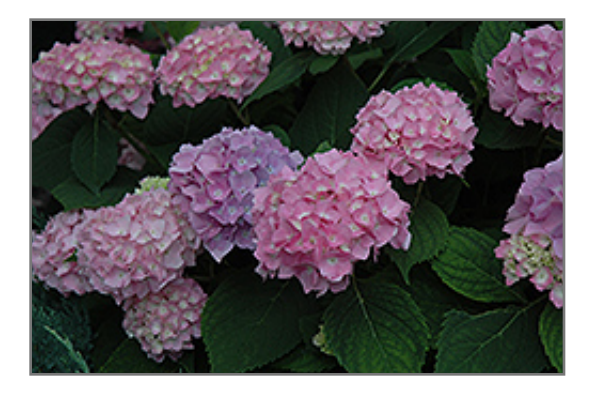
Endless Summer Hydrangea flowers

Endless Summer Hydrangea is recommended for the following landscape applications;