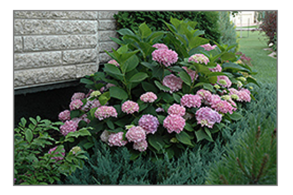
Endless Summer Hydrangea in bloom

Endless Summer Hydrangea will grow to be about 3 feet tall at maturity, with a spread of 3 feet. It tends to fill out right to the ground and therefore doesn't necessarily require facer plants in front. It grows at a fast rate, and under ideal conditions can be expected to live for approximately 20 years.