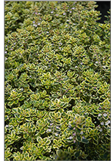
Lemon Thyme foliage

Lemon Thyme is smothered in stunning spikes of lilac purple flowers rising above the foliage from early to late summer. Its attractive tiny fragrant round leaves remain light green in colour throughout the year.