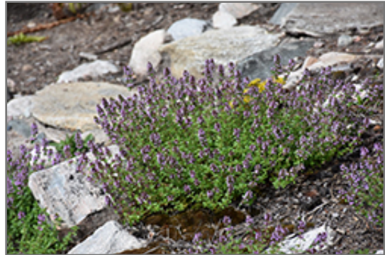
Lemon Thyme in bloom

This plant is quite ornamental as well as edible, and is as much at home in a landscape or flower garden as it is in a designated herb garden. It should only be grown in full sunlight. It prefers to grow in average to dry locations, and dislikes excessive moisture. It is considered to be drought-tolerant, and thus makes an ideal choice for a low-water garden or xeriscape application. It is not particular as to soil type or pH. It is highly tolerant of urban pollution and will even thrive in inner city environments. Consider covering it with a thick layer of mulch in winter to protect it in exposed locations or colder microclimates. This particular variety is an interspecific hybrid. It can be propagated by division; however, as a cultivated variety, be aware that it may be subject to certain restrictions or prohibitions on propagation.