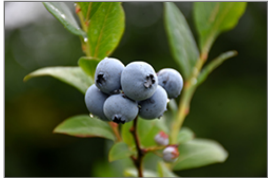
Northsky Blueberry fruit

Northsky Blueberry features dainty clusters of white bell-shaped flowers with shell pink overtones hanging below the branches in mid spring. It has green deciduous foliage. The glossy oval leaves turn an outstanding scarlet in the fall. It features an abundance of magnificent blue berries in mid summer.