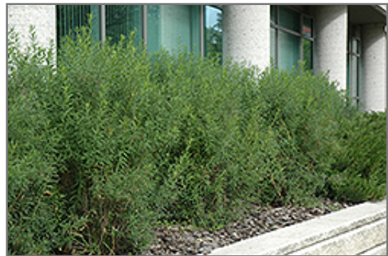
Turkestan Burning Bush