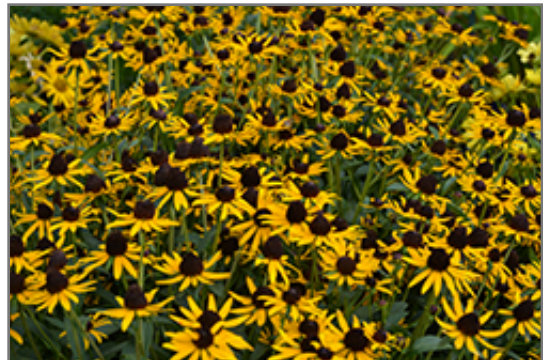
Little Goldstar Coneflower flowers