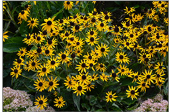
Little Goldstar Coneflower in bloom

This is a relatively low maintenance plant, and should be cut back in late fall in preparation for winter. It is a good choice for attracting butterflies to your yard, but is not particularly attractive to deer who tend to leave it alone in favor of tastier treats. It has no significant negative characteristics.