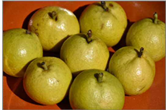
Golden Spice Pear fruit