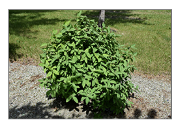
Borealis Honeyberry