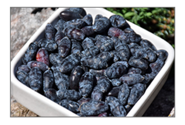
Borealis Honeyberry fruit

Borealis Honeyberry features subtle white flowers along the branches in early spring. It has green deciduous foliage. The narrow leaves do not develop any appreciable fall colour. It features an abundance of magnificent blue berries in late spring.