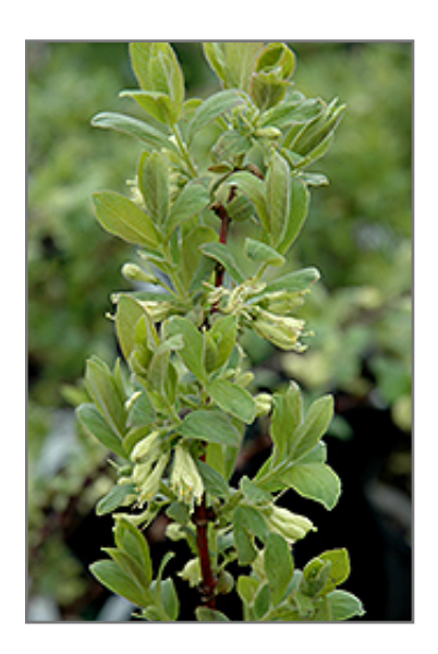
Borealis Honeyberry flowers

Borealis Honeyberry will grow to be about 5 feet tall at maturity, with a spread of 4 feet. It tends to fill out right to the ground and therefore doesn't necessarily require facer plants in front, and is suitable for planting under power lines. It grows at a medium rate, and under ideal conditions can be expected to live for approximately 20 years. While it is considered to be somewhat self-pollinating, it tends to set heavier quantities of fruit with a different variety of the same species growing nearby.