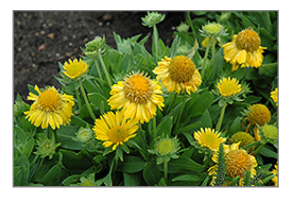
Mesa Yellow Blanket Flower flowers