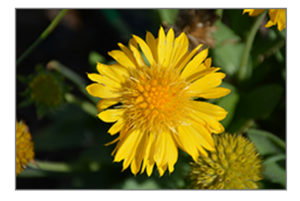
Mesa Yellow Blanket Flower flowers

Mesa Yellow Blanket Flower is recommended for the following landscape applications;