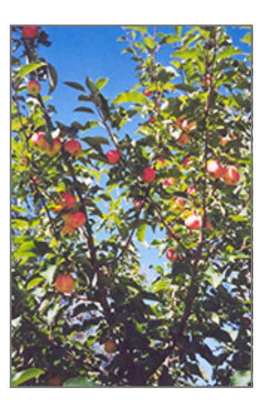
September Ruby Apple fruit